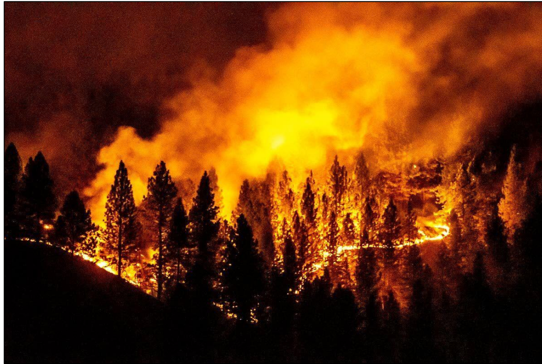
Above: A wildfire broke out on August 30 below old Ahsakha Grade, near Dworshak Dam. Left: Map delineating the 300+ acre fire area in red located approximately 2.5 miles West, Northwest of the Dworshak Dam and Hatchery as of 1 September 2020.