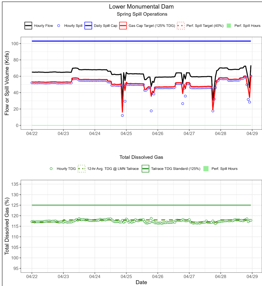
Figure 1. Hourly spill operations (top) and resulting total dissolved gas (bottom) at Lower Monumental Dam (April 22-28, 2025)