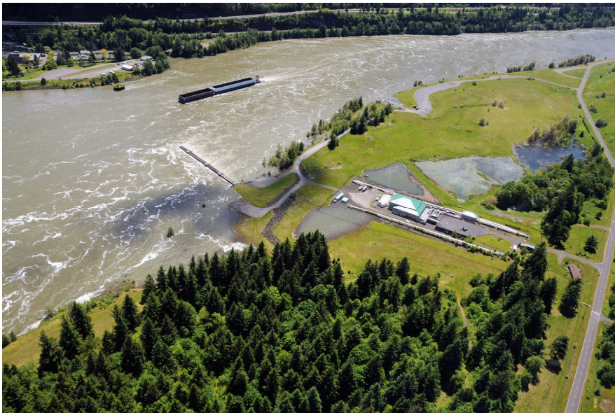
Bonneville Dam Juvenile Monitoring Facility June 3, 2011

***Submit requested revisions in track changes to this .docx file and email to crunyan@usbr.gov , ranorris@bpa.gov , and douglas.m.baus@usace.army.mil , by August 22. It is difficult to assume specific requested changes that may come in the form of subjective comments (for example, add more, take some out, rework this paragraph, etc.), supplemental memos and/or an overview narrative in a separate email, so please provide specific requested narrative changes in track changes to this document.