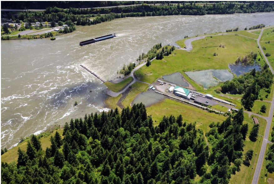
Bonneville Dam Juvenile Monitoring Facility June 3, 2011

***Submit requested revisions in track changes to this .docx file and email to crunyan@usbr.gov , ranorris@bpa.gov , and douglas.m.baus@usace.army.mil , by August 22. It is difficult to assume specific requested changes that may come in the form of subjective comments (for example, add more, take some out, rework this paragraph, etc.), supplemental memos and/or an overview narrative in a separate email, so please provide specific requested narrative changes in track changes to this document.